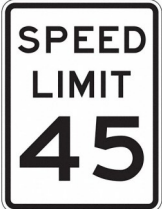
(Proposed ) Between Alma Dr to Watters Rd